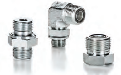
ORFS ADAPTERS ORFS J1453