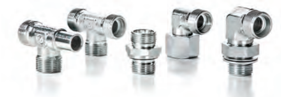
DIN 24° ADAPTERS DIN 2353