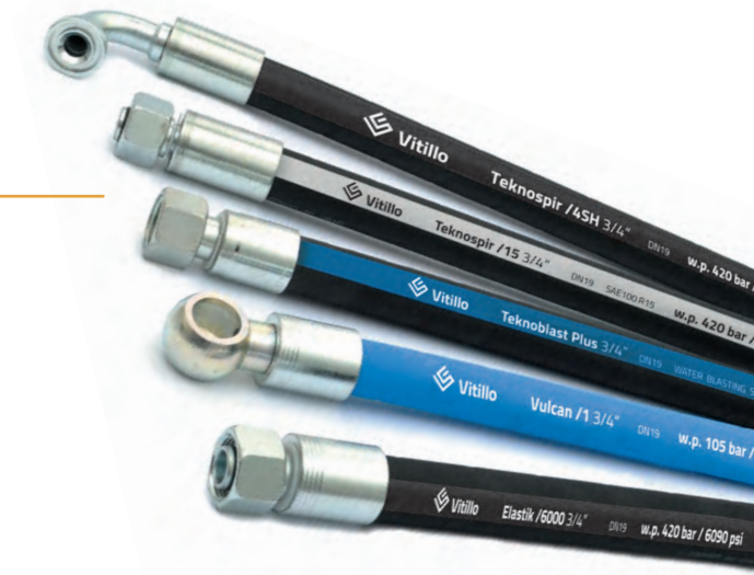
HYDRAULIC HOSES Braided hoses Spiral hoses Special hoses