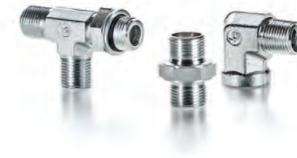
BSP ADAPTERS BSP 5200

Our presence in the most important strategic areas guarantees the best market coverage and give us the possibility to meet the peak demands of the market all over the world. The group is in fact today in Germany, Poland, Macedonia and USA.