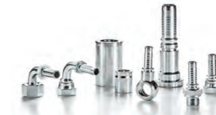
PRESS FITTINGS ISO 12151 - SAE J516