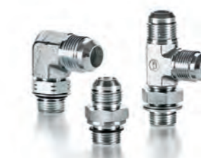
JIC ADAPTERS SAE J 514